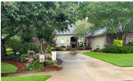
June Yard of The Month 9552 Vouvray Drive

The winner for July is 19031 Beaujolaes Ave . Congratulations to both and to all who strive to keep their yards looking so nice.