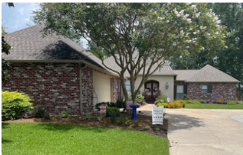
July Yard of The Month 19031 Beaujolaes Ave