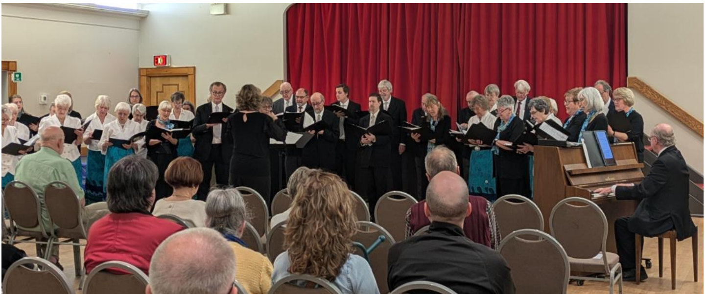
Lyra Choir and Germania Choir ensemble performance at Tag des Liedes, June 1, 2025.