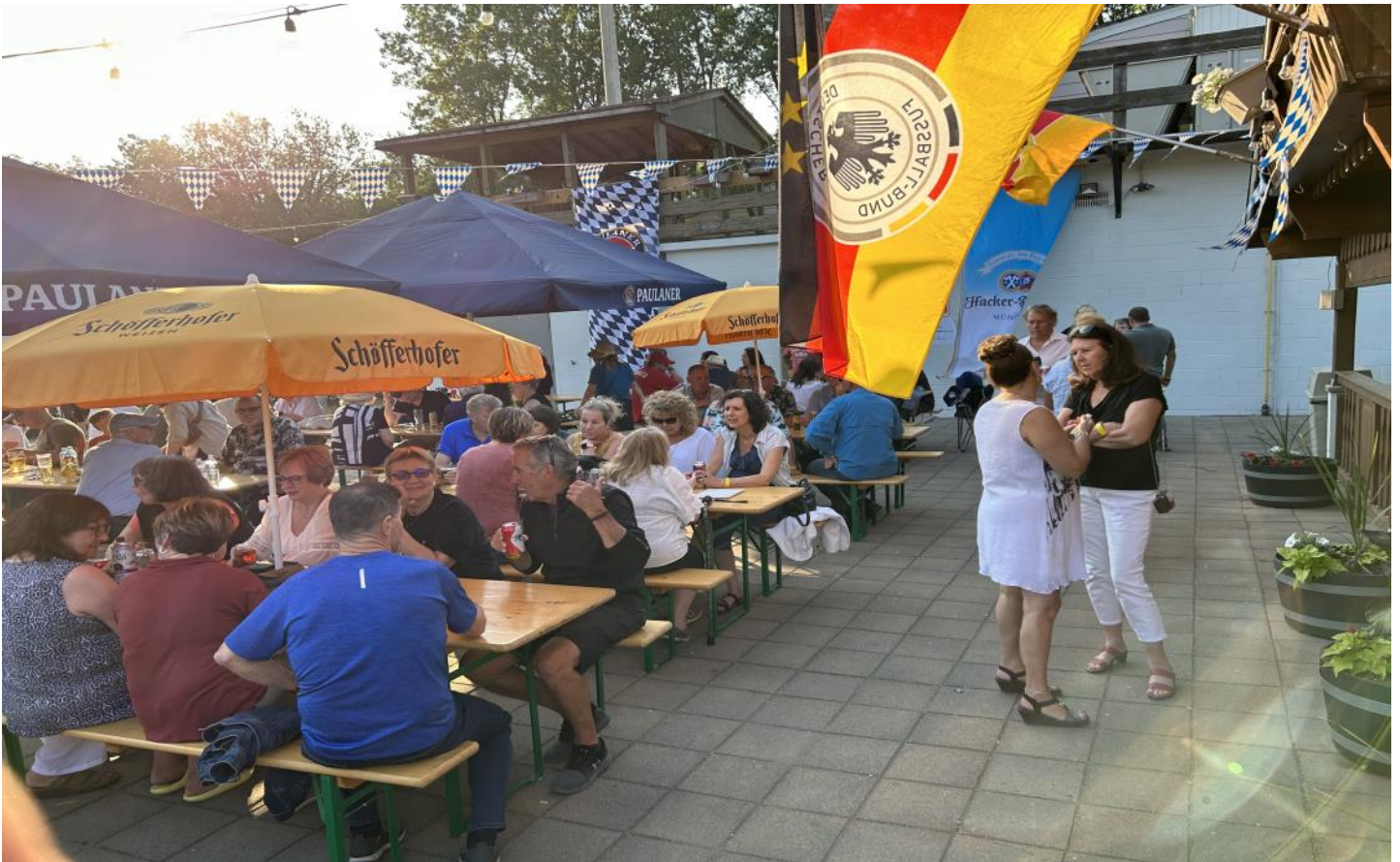
Happy patrons enjoying the Biergarten.