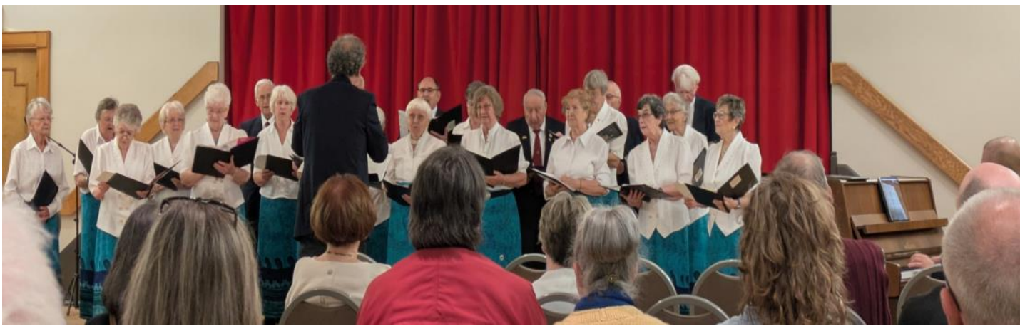
Germania Choir from Hamilton performing at Tag des Liedes, June 1, 2025