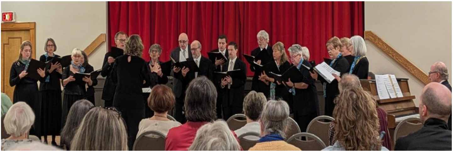
Lyra Choir performs at Tag des Liedes, June 1, 2025