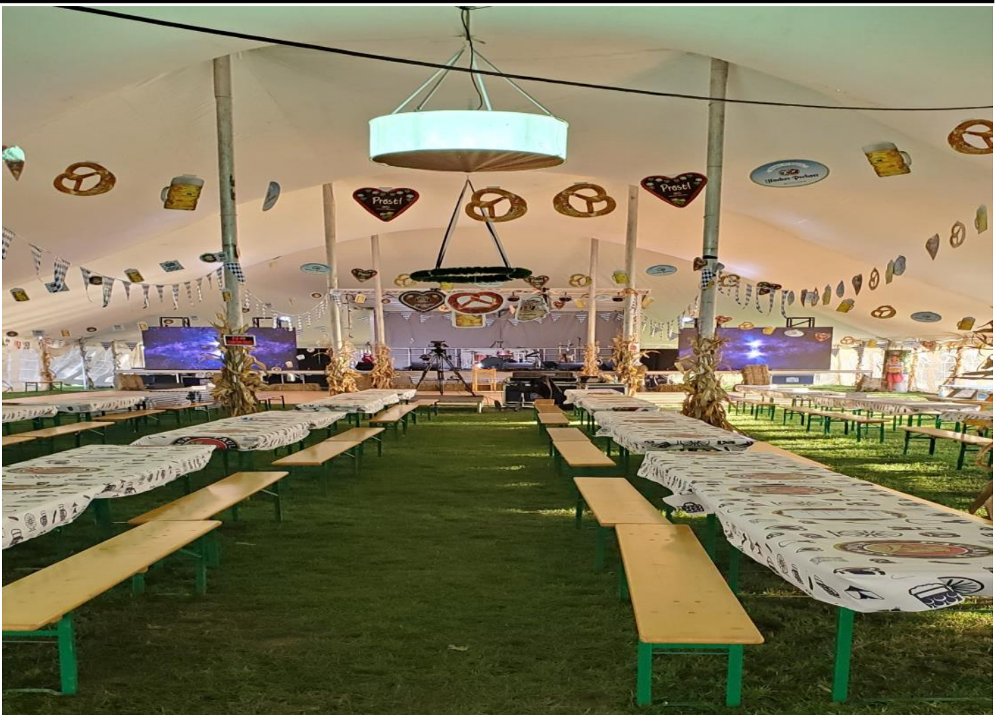
Oktoberfest Tent 2022

On behalf of the Membership Committee, we would like to thank everyone for their support of the German Canadian Club and promoting German culture and traditions in London.