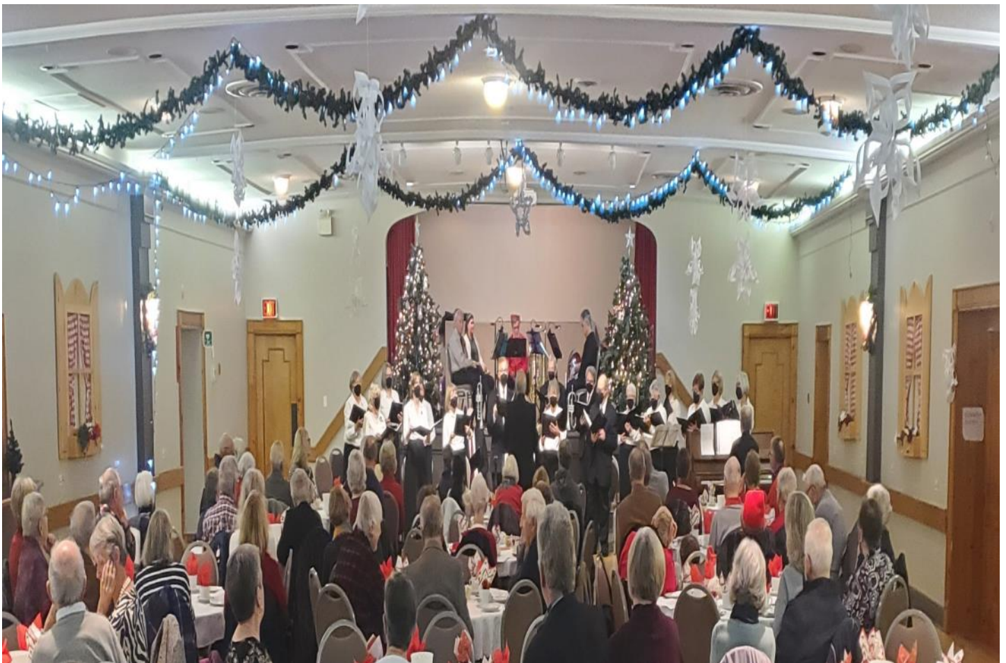
December 2022-Lyra Choir Christmas Concert