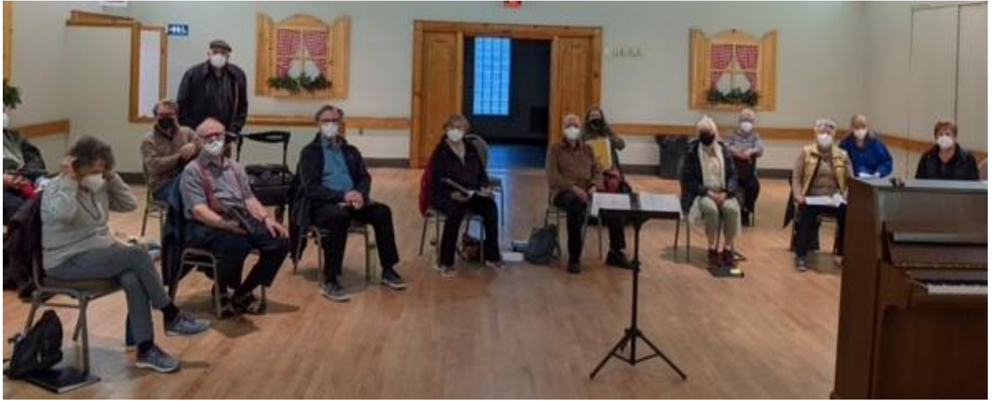
May 2022—The first rehearsal of the Lyra Choir in two years due to the pandemic.