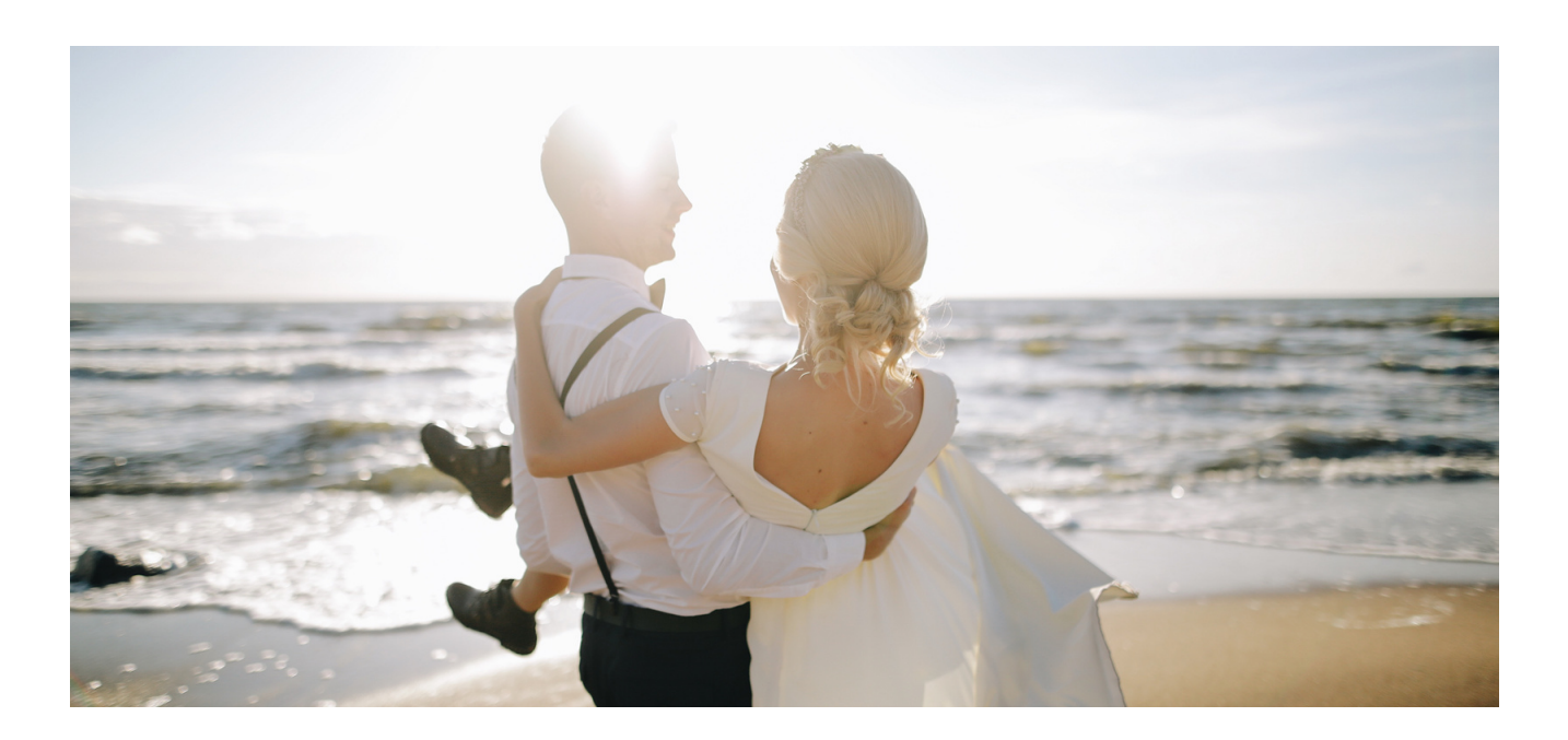
Talk to you soon,