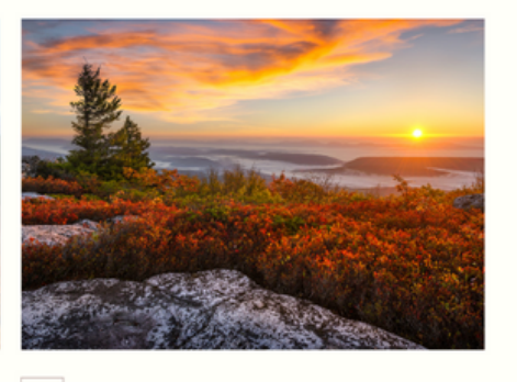
West Virginia, United States