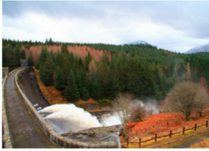
Scottish Highlands, Scotland