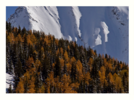
Rocky Mountains, Colorado