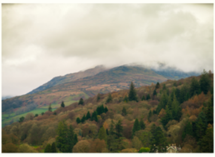
Lake District, England