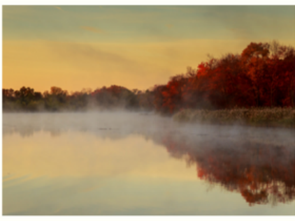
Waterton Lakes, Alberta, Canada