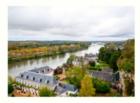
Loire Valley, France