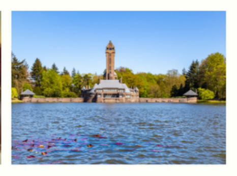
De Hoge Veluwe National Park, Netherlands