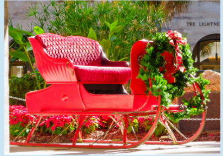
St. Augustine, Florida