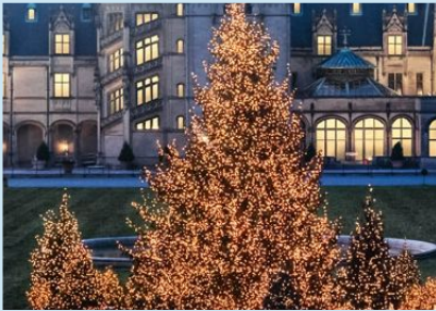
Asheville, North Carolina