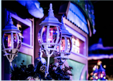
North Pole, Alaska