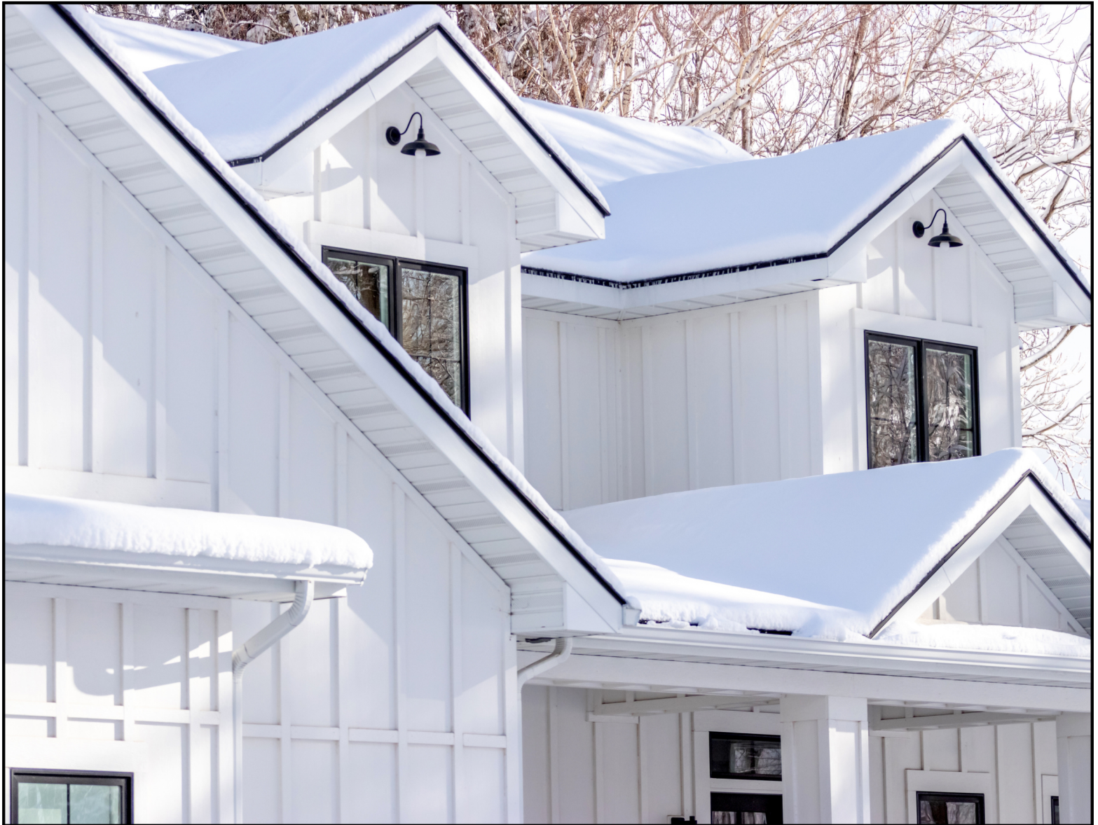
Board & Batten Moulding