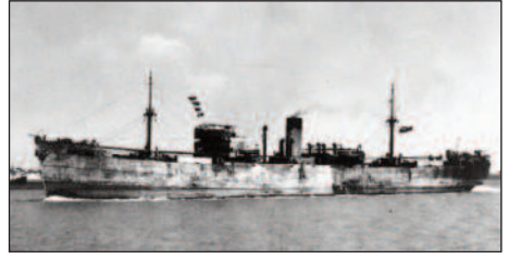
The tramp steamer 'Broompark'