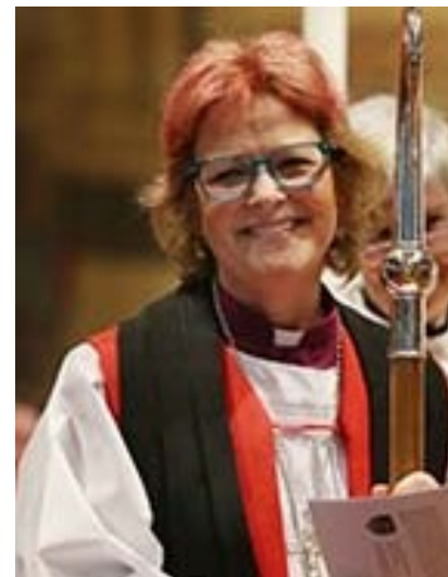
The Rt Revd Kate Prowd Bishop Of the Oodthenong Episcopal Area

Preparation classes for adults and young people will happen separately and at different times. Confirmation classes will take place over a period of