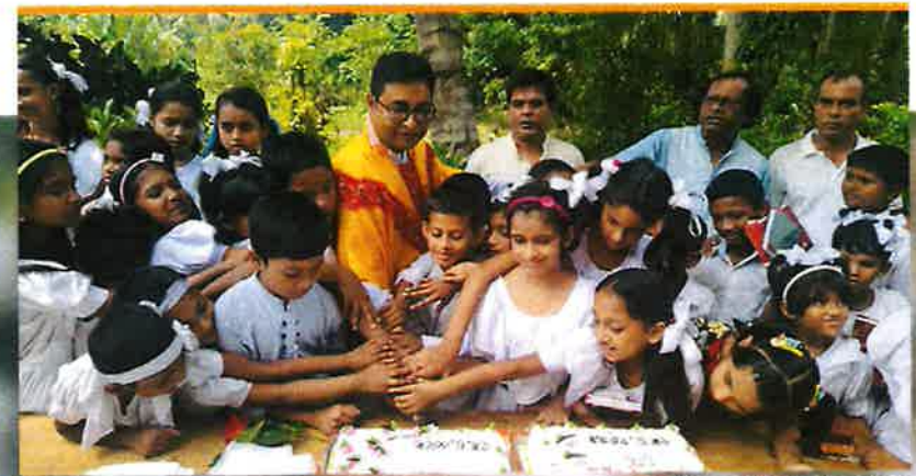
The Diocese of Barisal, Bangladesh

As you pray for your five people today, hold them in God's presence, and ask that despite whatever challenges they may be facing, that they might allow the Lord close enough to do what He alone can do.