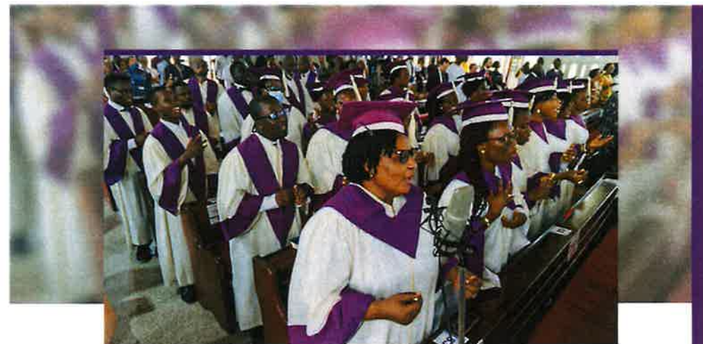
Anglican Consultative Council service, Ghana

The African Study Bible puts it like this: 'No one likes to eat stale food or read twenty-year old newspapers. We want fresh food and current news. Let us not give to God a love that is stale and cold. Let us repent of any pretending in church.' It is no wonder then that John's letters are full of encouragements to love each other in the Christian community. The tradition, that in extreme old age John would still urge believers, 'Little children love one another', makes all the sense in the world in the light of today's verse.