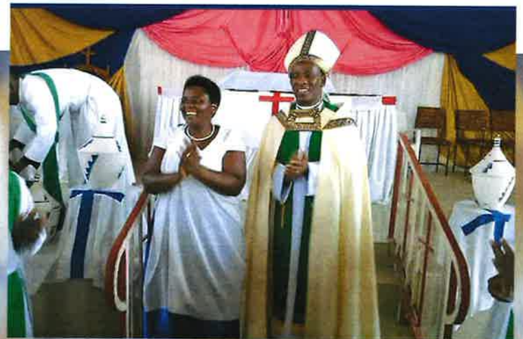
Bishop of Rutana & his wife in Rutana Diocese, Burundi

When we bring our five friends to him and say that we do not know how to share Jesus with them, He reminds us that he has promised to give us the words and that there is no greater sermon than a Christ-like life.