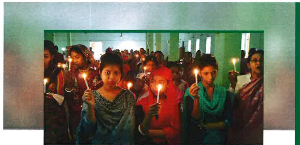
Praying women in Barisal Diocese, Bangladesh

Jesus has challenged, as well as encouraged, the church. When the Bible gives us a challenge: something to change, something to work at, something in us that is not as it should be, it is easy to feel, 'I'm hopeless, I don't have the strength to do anything about that. I've tried and failed many times before.' That is not what God wants. That is why He has given us the amazing power of the Holy Spirit so that He can do what we cannot.