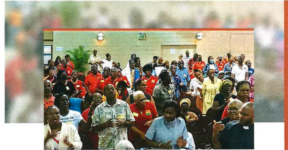
Renewal Conference, Diocese of Trinidad and Tobago

Ultimate power is not wielded by armies or politicians; it rests with our loving heavenly Father who never forgets us for a second. He is the Father who knows