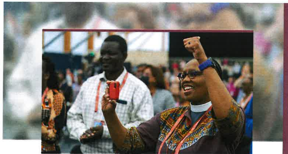
Delegates at the Lambeth Conference

Some cultures give great respect to older people but pay little attention to the needs of the young. Others invest in opportunities for young people while undervaluing