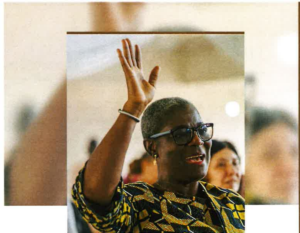
The Anglican Communion Office.

The white hair and flaming fire come from the picture of Almighty God in Daniel chapter 7. There is no doubt that the one who speaks does so with the character and authority of the Lord of all things. Of course, the language of Daniel 7 has been there from the start of today's reading in the phrase 'One like the Son of Man.'