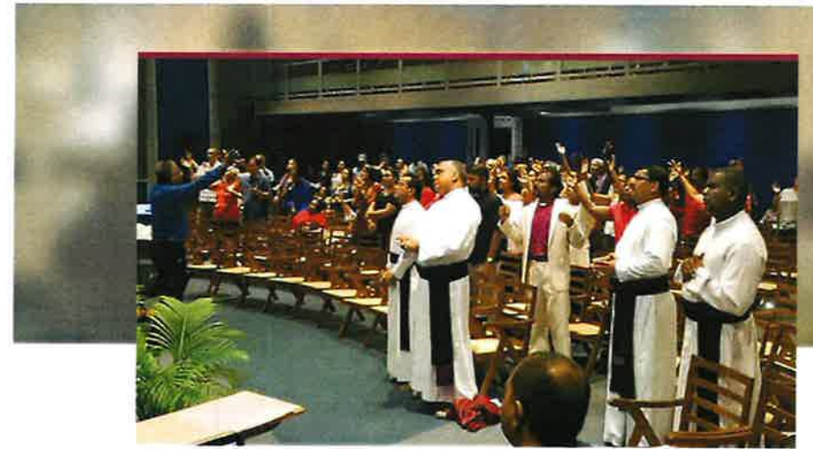
Trilingual Thy Kingdom Come Event, Colombo, Sri Lanka

Does that sound a strange gift? They might have preferred more answered prayers, more gifts of the spirit, a closer sense of His presence, or a whole host of other things. What they get is an invitation to share Christ Himself with their friends, their culture, their city.