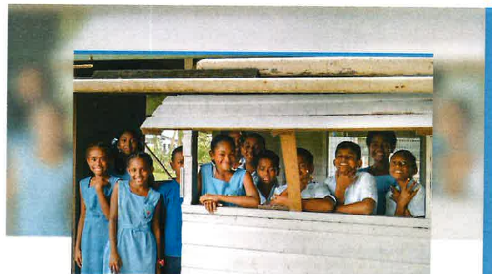
Children at an Anglican School in Fiji

God loves to create and to re-create when things go wrong. When this happens, when our sin spoils and scars the world, our relationships with each other and our relationship with God, He already has a plan of salvation ready. It is a plan that will lead to the crucifixion, the resurrection and the glory of heaven for those who believe in His son, Jesus Christ.