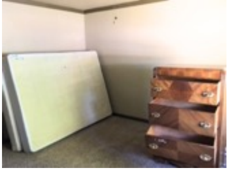
ALL ROOMS CLUTTER FREE