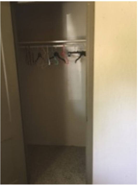
ALL CLOSETS EMPTY