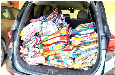
TRUNKS OF LOVE