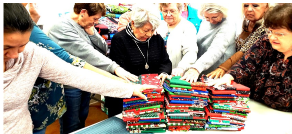
PRAYERS OVER EVERY QUILT AND PILLOW CASE CREATED