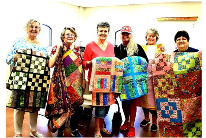
SOME OF OUR AMAZING QUILTS OF GRACE VOLUNTEERS