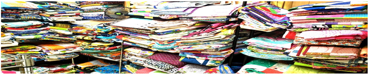
THE TIP OF THE ICEBERG

Recently they sewed 125 Christmas pillowcases for BCAC/CASA. Soon to follow was a very generous donation: 125 pillows! Wow! These ladies are so grateful to those who have donated quilts, fabric, other sewing supplies as well as monetary donations to keep their ministry Uvalde Strong!