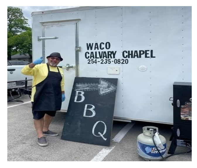
Waco Calvary Chapel was just one of many offering free food to Uvalde. Our hearts are full.