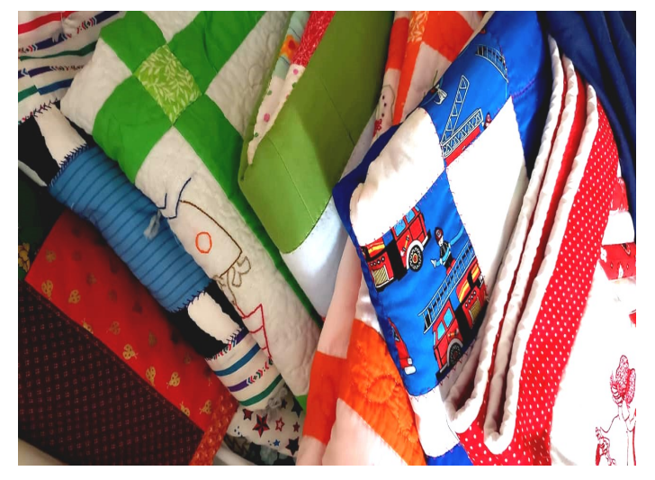
Quilts of Grace is receiving donations of quilts and supplies from all over the country for the families and area children and teens.

Comfort Dogs. Love given...Love received.