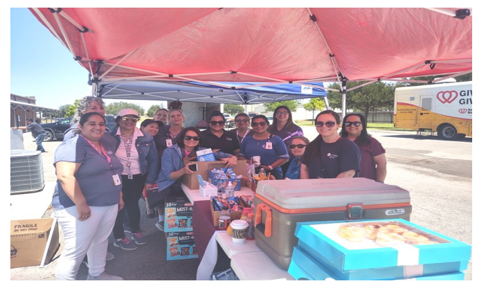
Methodist Healthcare Ministries jumped right in all 3 days with food and water for our blood donors. Thank you !

Over 200 were in line at one time. Some waiting all day to donate with no complaints. Everyone wanted to help. Thank you all so much!