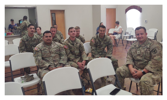
15 plus Army Reservists drove 6 hours from McAllen, Texas to donate blood. We so appreciate y'all.