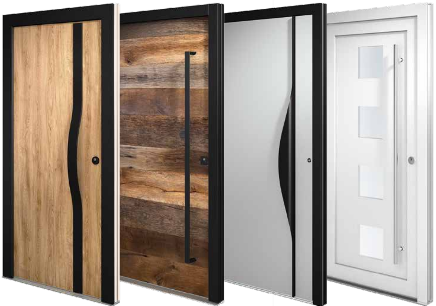
ALUMINIUM-WOOD FRONT DOORS

An innovative, technically mature front door fulfills its tasks for many years and looks very good at the same time!