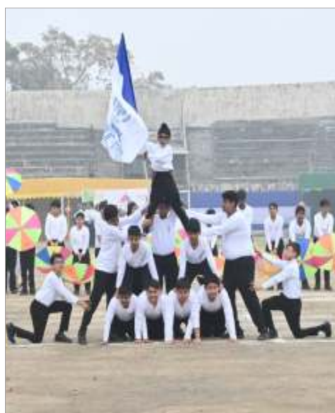
Students of Ruby Park Public School performs at their annual sports day.