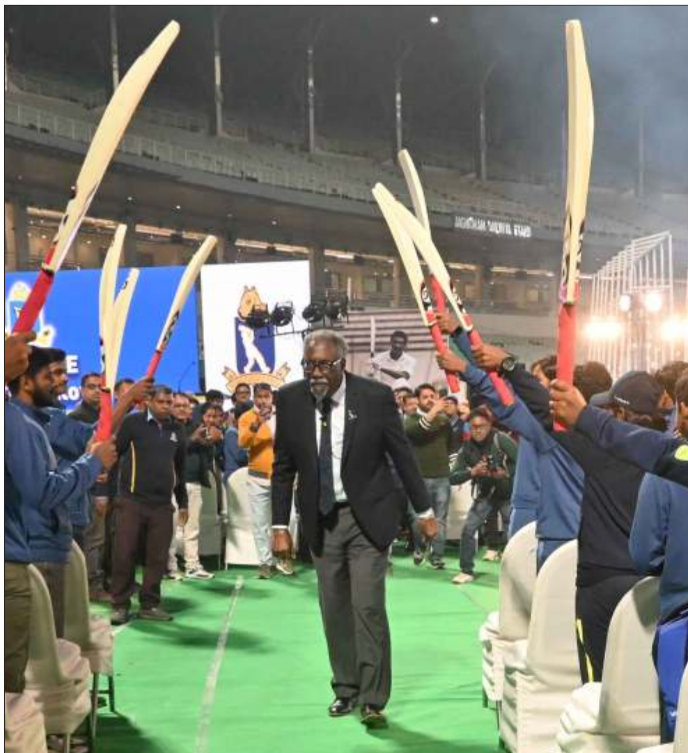
West Indies Former Cricketer Clive H. Lloyd was Felicitated by Cricket Association of Bengal at Eden Garden in Kolkata.