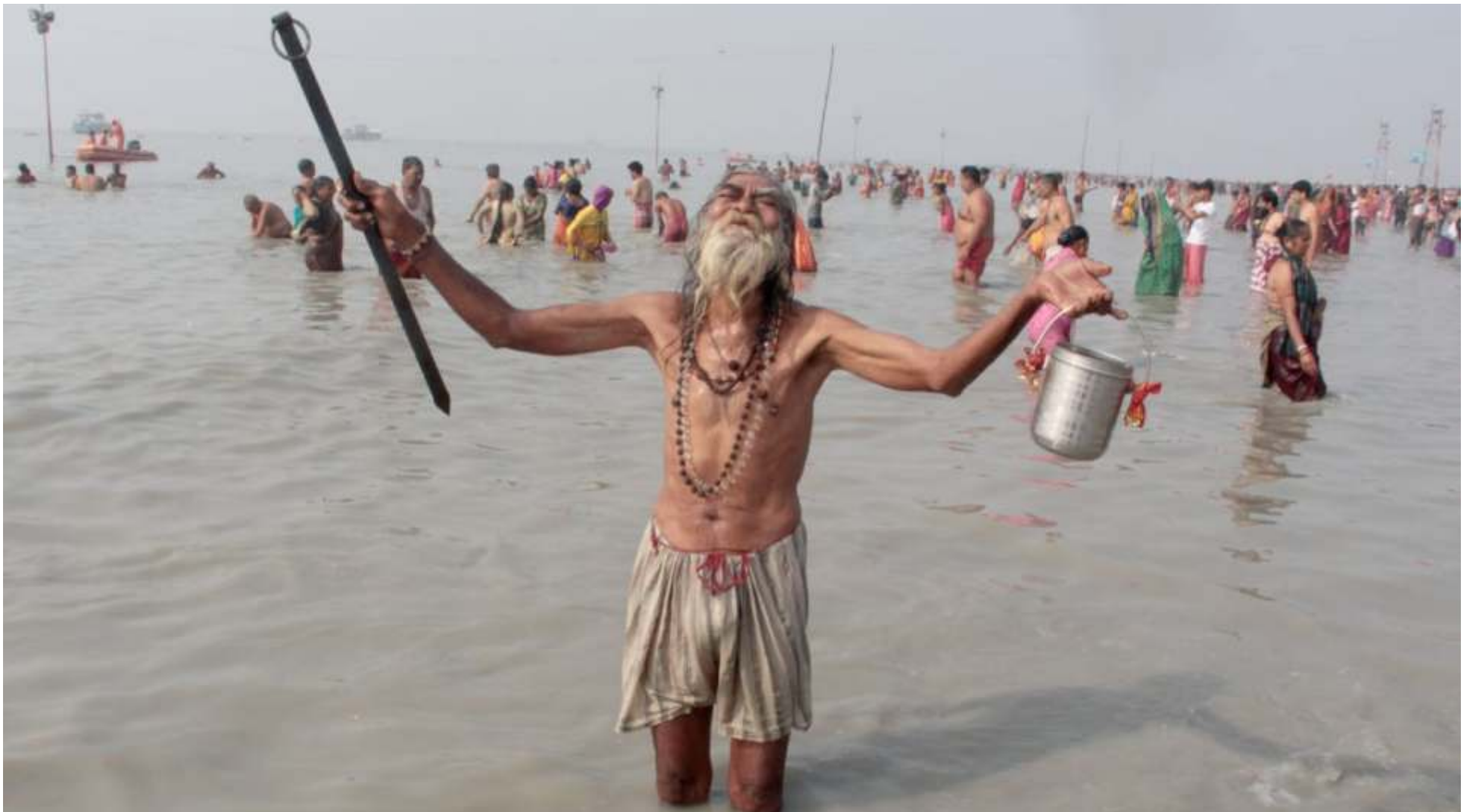
Sage at Sagar : A sadhu pray after bathing in Ganga Sagar Mela in West Bengal.