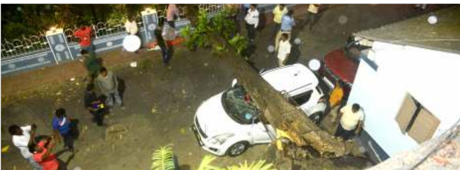
A tree has fall down on a car during the Norwester storm in evening on Monday May 15 2023 at Alipore. No one was injured.