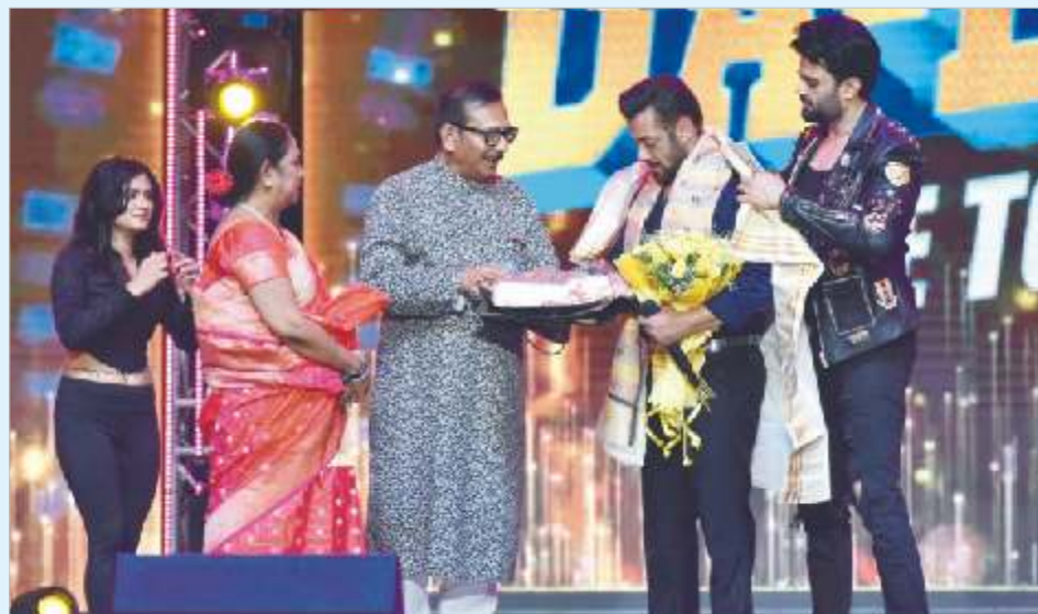
Bollywood superstar Salman Khan take part in The Dabang Show at East Bengal Club on 13 May to commemorate the club's centenary celebration, in this occasion Transport Minister Arup Biswas handing over the booke to the Star and he was felicitated by East Bengal Club's officials.