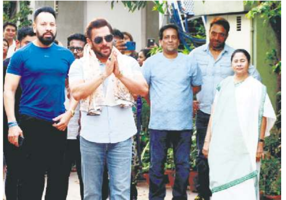
DIDI's HOUSE : Superstar Salman Khan on his visit to Kolkata meets Chief Minister Mamta Banerjee at her resident. Mamta Banerjee welcomes the actor offering Uttoroyo at her resident.