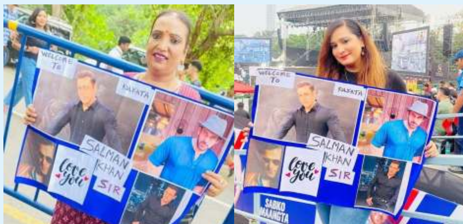
Fans outside East Bengal Club ground greets superstar Salman Khan as he perform for his upcoming movies Dabang 3.