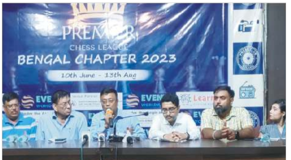
CHESS LEAGUE : Overview With Worldwide (an objective to promote chess in big way across the districts of West Bengal Ever BTSP) has come up with the first of its kind chess league .will be played as open to all format 'The tournament will be held in all 23 districts of West Bengal, from 10th June-13 August 2023.