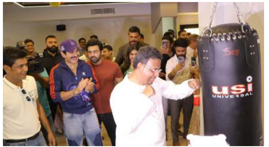
Inauguration Agrani Fitness Studio at Chetla Agrani Club premises dated by Mayor Firadh Hakim were present Bengali film actor Jeet.