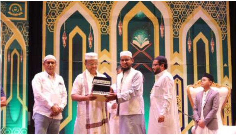
Kolkata mayor Firhad Hakim was honoured at a program ,Hafj - ul - Quran Competition 2024 Organised by All India Quran ALO Foundation at Dhana Dhanya auditorium.