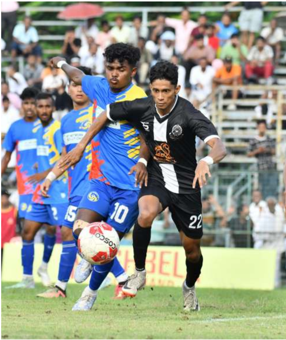
Mohammedan Sporting Club faced their first defeat of the season when they went down to Kalighat Milan Sangha 1-2 in the CFL.