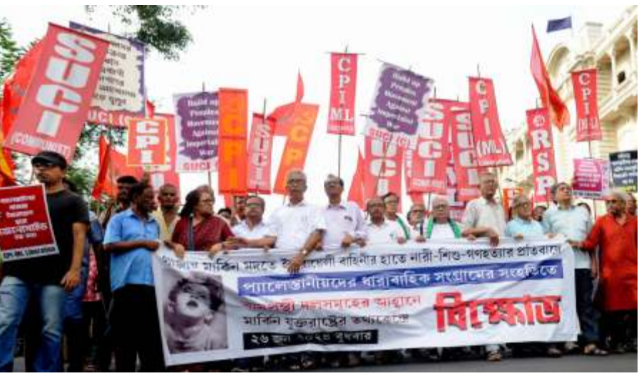
Left party protest in Kokata against mass killing of the children and women by israel soldiers in Gaza.