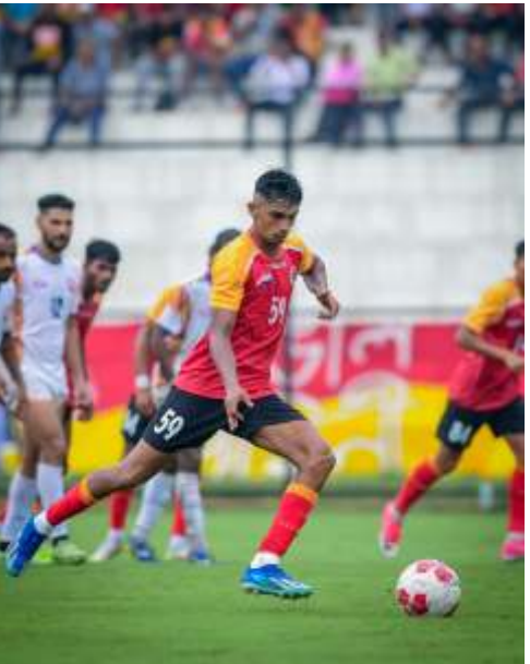
East Bengal : Emami East Bengal start their CFL 2024 campaign with a 7-1 win over Tollygunge Agragami. (Pic: Sanchita Chatterjee).