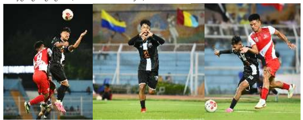
Mohammedan Sporting: Three times consecutive Calcutta League champions and Kolkata giants Mohammedan Sporting Club start their CFL 2024 campaign with a whopping 6-0 victory over Wari AC.KOLKATA, 25-06-24Mohammedan Sporting Club launched their campaign in the Calcutta Football League 2024 in spectacular fashion, securing a resounding 6-0 win over Wari AC in their opening match held at Kishore Bharati Krirangan.