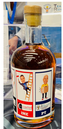
Custom Bourbon Raffle