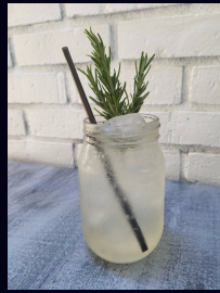
ROSEMARY LEMONADE 8 / 6

LUCIDI DISTILLING'S VENTILATE VODKA, HORSERADISH, WORCESTERSHIRE, & CRISPY BACON