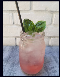
HAYMAKER BREEZE 8 / 6

DEEP EDDY LEMON VODKA, FRESH ROSEMARY & GINGER, HOUSEMADE SIMPLE SYRUP, LEMONADE & CLUB SODA