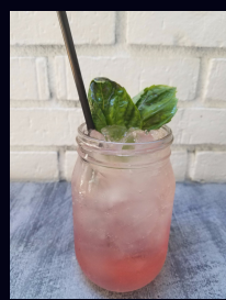
HAYMAKER BREEZE 8 / 6

DEEP EDDY LEMON VODKA, FRESH ROSEMARY & GINGER, HOUSEMADE SIMPLE SYRUP, LEMONADE & CLUB SODA