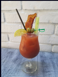
BACON BLOODY 8 / 6

SKINNY GIRL CUCUMBER VODKA, BASIL SYRUP, TRIPLE SEC, LEMON JUICE, CLUB SODA