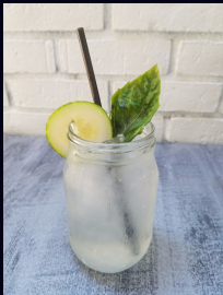
COOL CUCUMBER 8 / 6

SKINNY GIRL CUCUMBER VODKA, BASIL SYRUP, TRIPLE SEC, LEMON JUICE, CLUB SODA