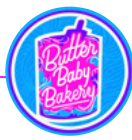
TABLE RUNNER CAKE