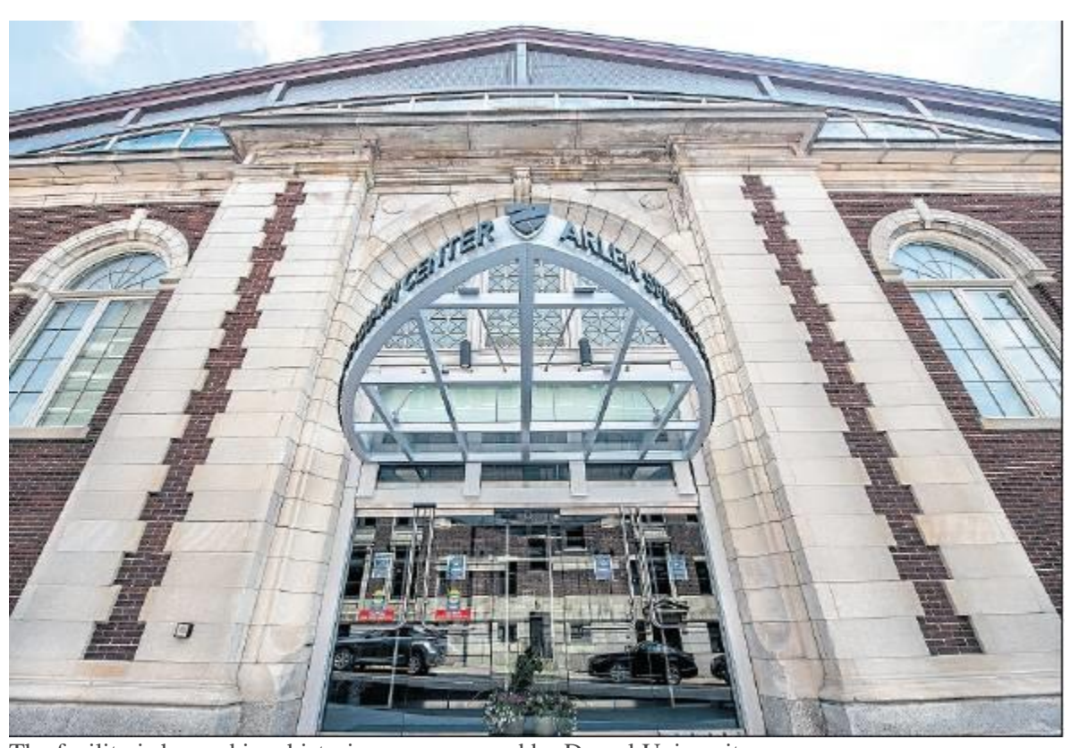
The facility is housed in a historic armory owned by Drexel University.