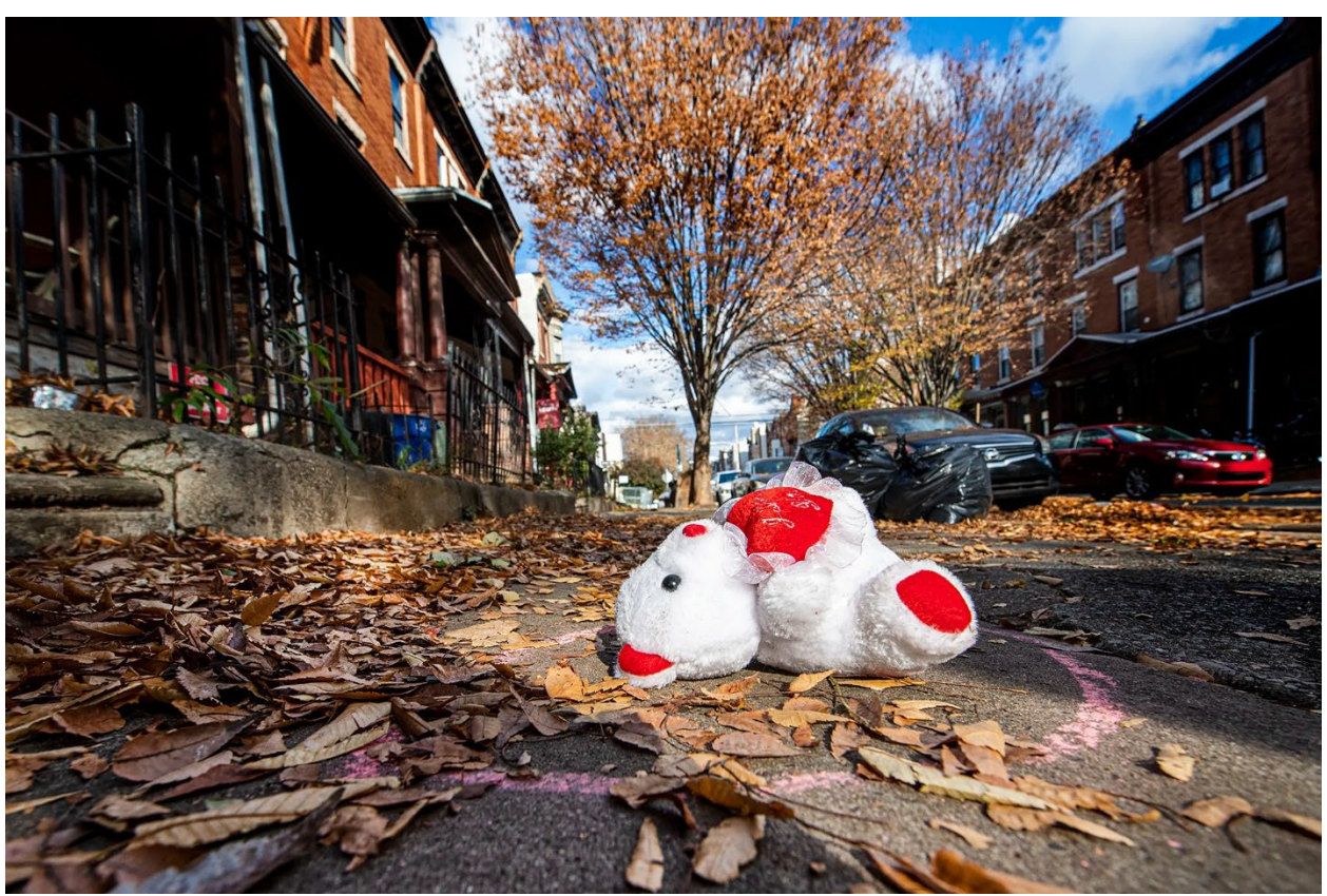
A teddy bear lies as a memorial on the location where a Temple University student was shot and killed in North Philadelphia.