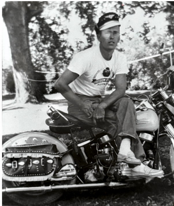
1953 FLE 74" Pan Head