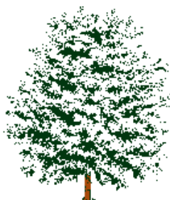
THE LAW and its messengers