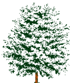
THE PROPHETS and their message(s)

The 'lampstands attached to olive trees' arrangement is similar to the 'branches attached to the olive tree' arrangement found in Romans 11:17-24. It also mimics the 'branches of the vine and the vine' arrangement in John 15:1-8.