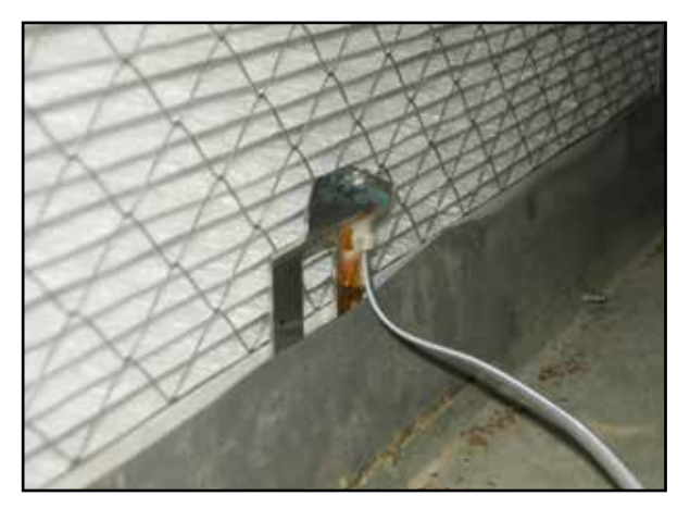
1 inch Bracket Installed in Filter Tray