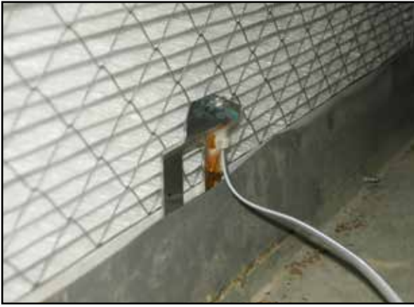
1 inch Bracket Installed in Filter Tray