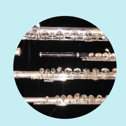
How to develop a great sound throughout all the registers