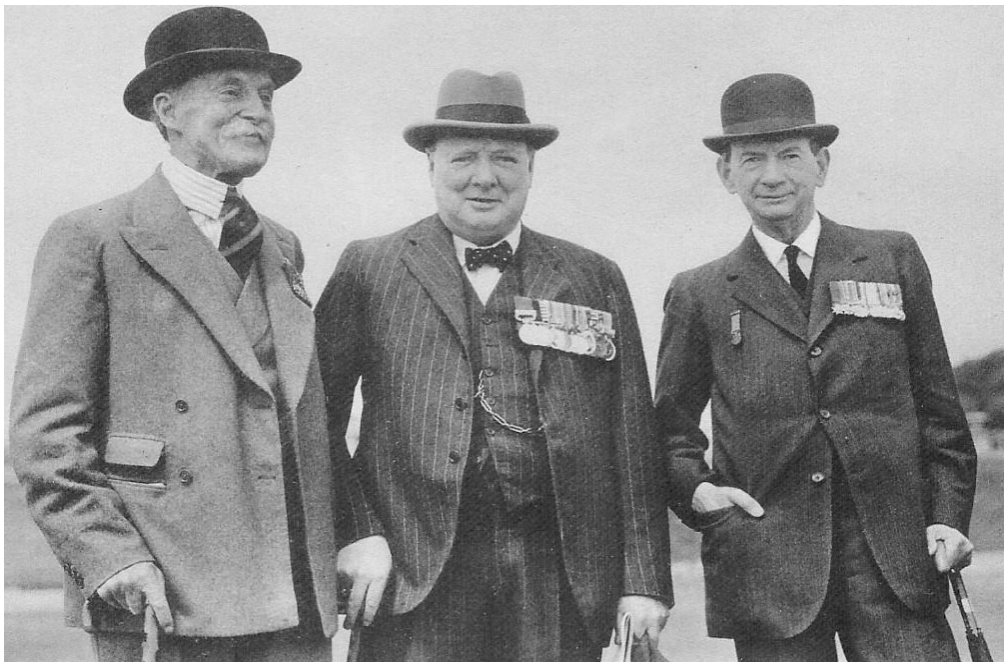
Left to right: General Sir Ian Hamilton; Mr Winston Churchill; Roger Keyes, Admiral of the Fleet, at a reunion of the Royal Naval Division, Crystal Palace, London, 1938.