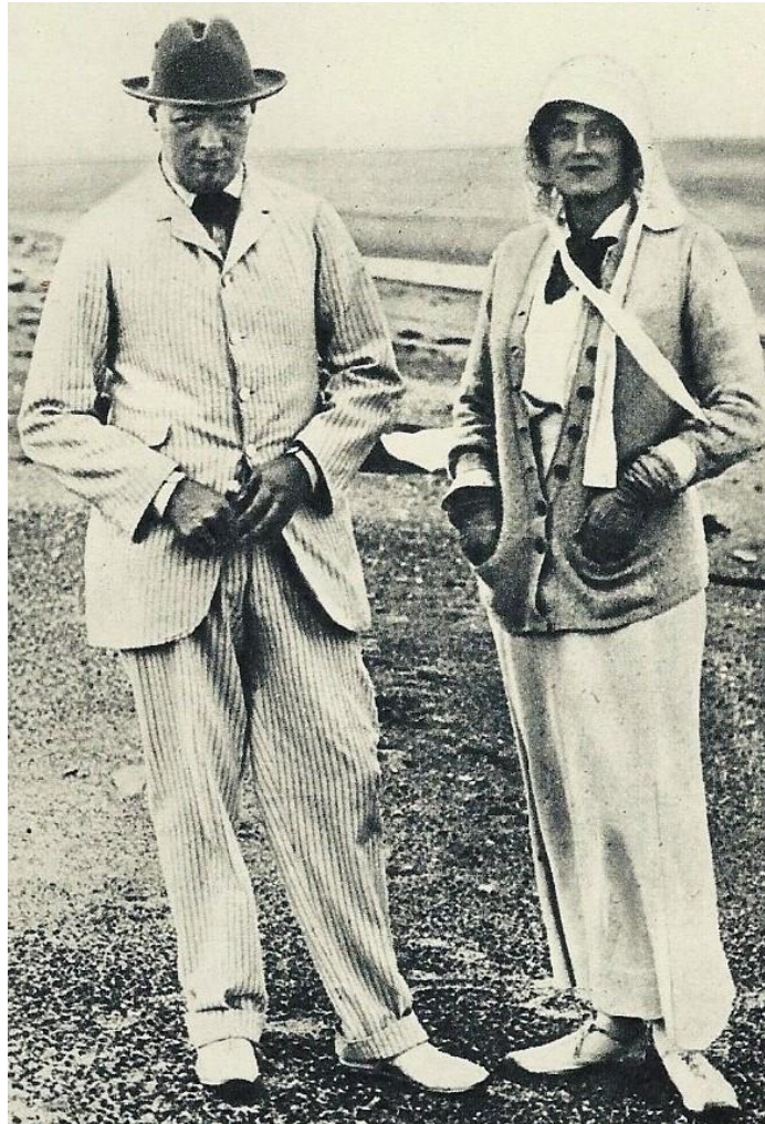
Winston and Clementine Churchill on holiday by the sea, just prior to the declaration of the First World War, 1914.