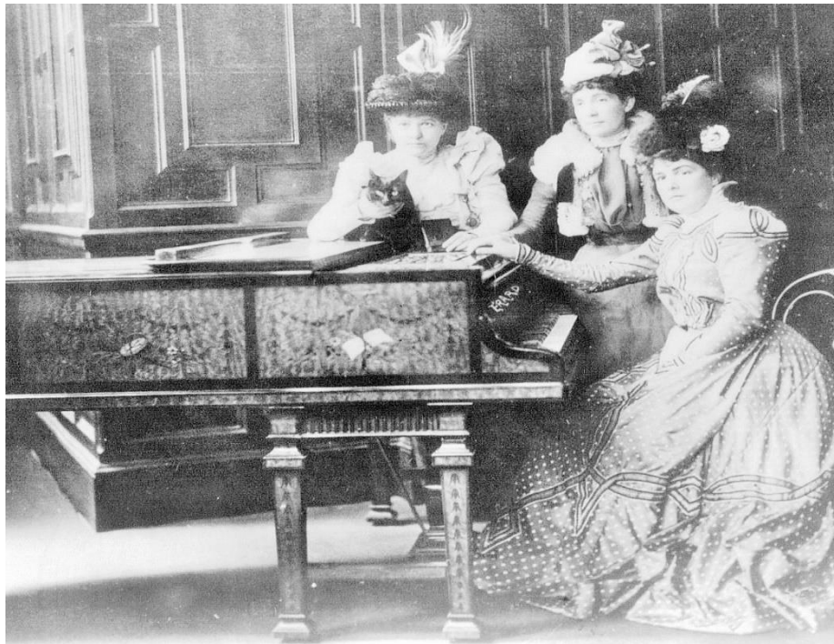
Jennie, Lady Randolph Churchill and friends, entertaining at a party.