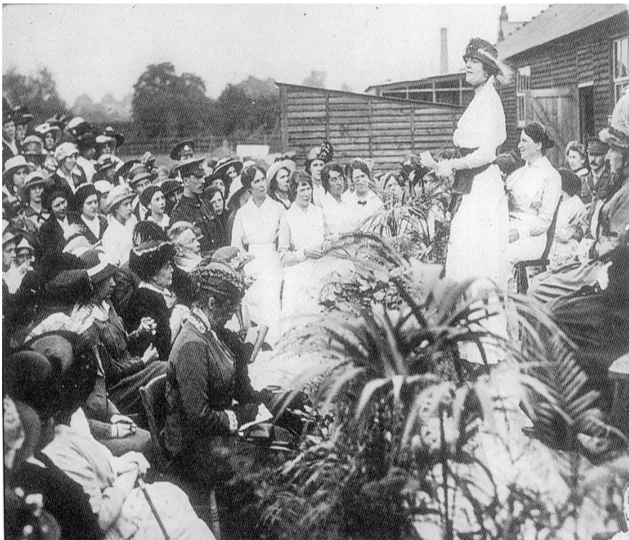
Clementine Churchill speaking at the opening of the first YMCA hut canteen for women munitions workers, Edmonton, north London, August 1915.