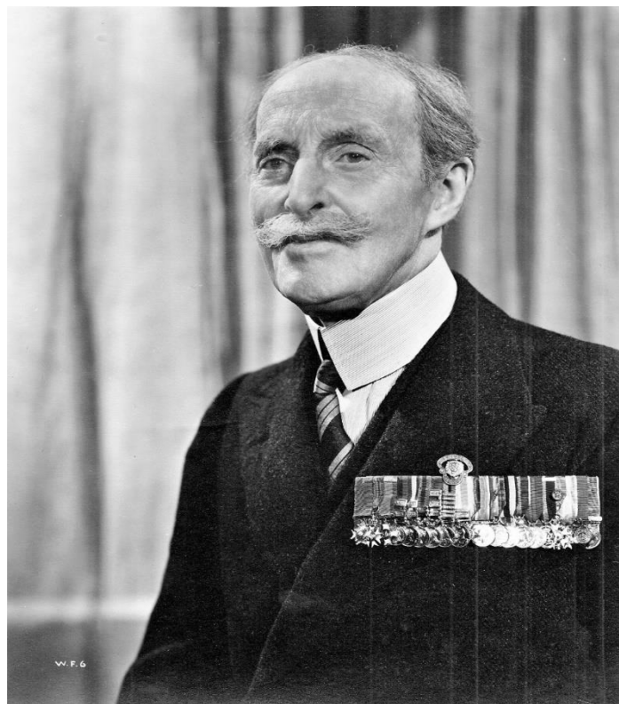
General Sir Ian Hamilton

‘We had a very exciting dinner. Winston after two large goblets of iced champagne, became very communicative. ... Afterwards in the drawing-room, he walked about the room, declaiming, shouting, trying his oratory on me, as Ian says. He was terribly excited, talking about Lord Kitchener, said he had a spitting toad inside his head, he pressed his hands hard over his own head and eyes to show the baffled weariness of trying to deal with such a fool.’ (29 May 1916, Postlip Hall).