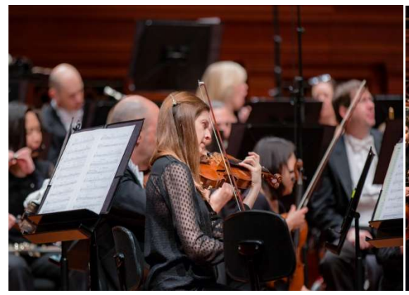
Nashville Symphony Orchestra