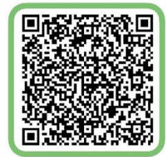
Scan to Pay with Zelle

Zelle payments are typically processed within minutes and are the fastest way to pay. Some banks offer recurring Zelle payments. Please check with your bank if you'd like to set this up.