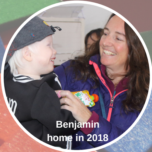
Benjamin home in 2018