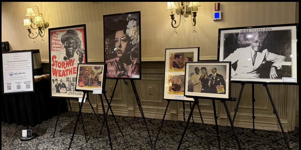
Pictured above: Selections from TBC Collection - A Night at The Cotton Club, North Oakland Macomb Jack and Jill of America Chapter Founders Day Event