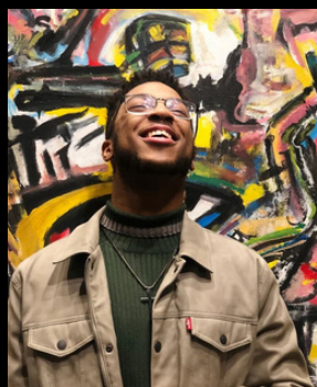
Miles Reuben filmTOY Studios

To learn more about our moderator and panelists, visit: black-canon.com/art-of-the-ages