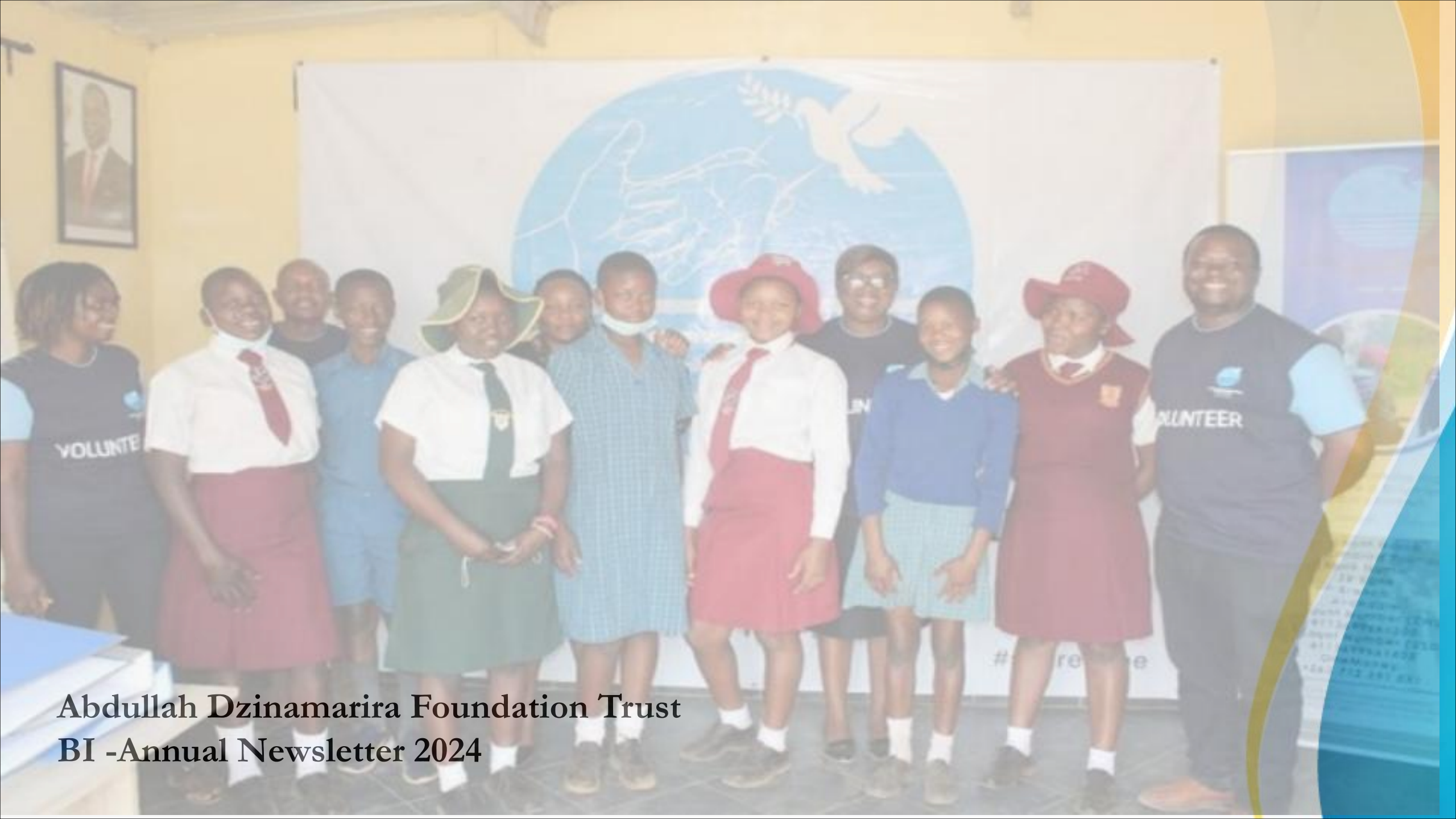
Abdullah Dzinamarira Foundation Trust BI -Annual Newsletter 2024