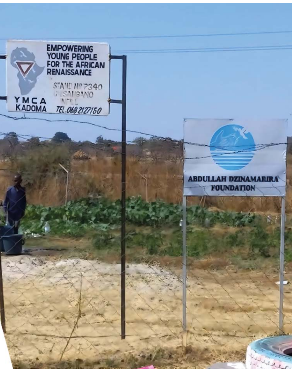
YMCA and ADFT working with young people for eco-friendly food production S Nyoka, 2023

At the heart of its work, GF4Cs sets up participatory governance for diverse actors to collectively identify local solutions to their local food related challenges.