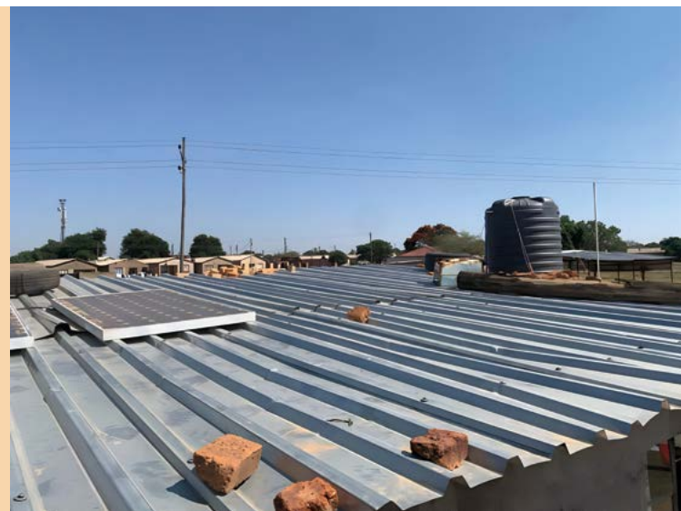
Solar panels help to create a more resilient and sustainable power grid, S Nyoka, 2023