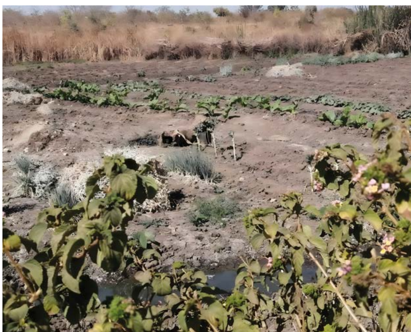
People grow vegetables near a wastewater effluent pose risks to public health. R Marara, 2023

Given the water scarcity in the city, Rimuka residents practice urban agriculture where they can access water, including around sewage stations, where they can access water and organic fertilizers. Growing vegetables near wastewater effluent, while a response to water scarcity and a survival measure, can expose consumers to illness from harmful bacteria and viruses if contaminated and inadequately cooked vegetables grown near the effluent are eaten (Wear et al., 2021). To mitigate this risk, people need to practice proper hygiene, washing hands with soap and hot water before and after handling vegetables grown near wastewater effluent and washing the vegetables and not eating them raw or poorly cooked. At the same time treating effluents and not growing any products close to the soil or those eaten raw would also reduce the risk.