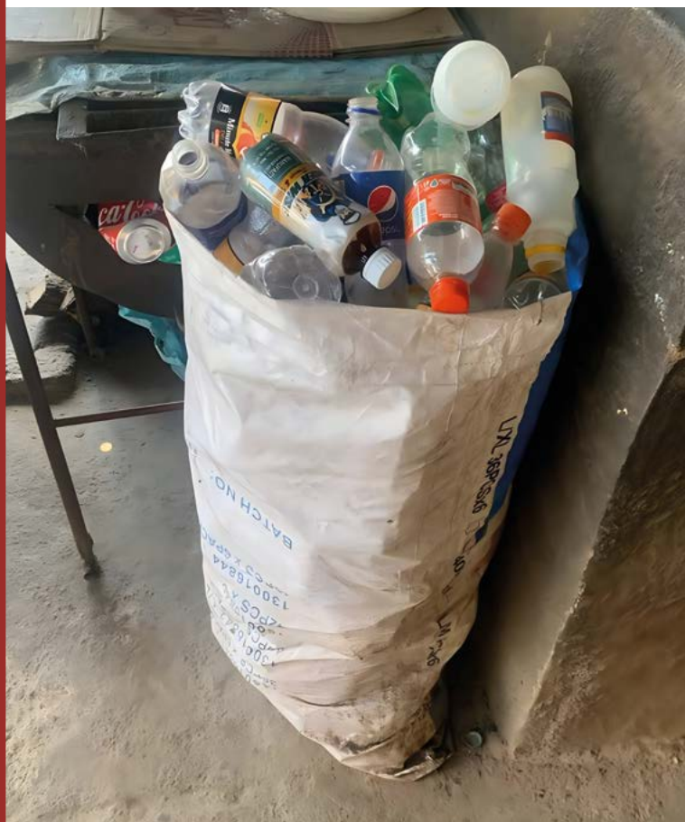
Collecting plastic waste, S Nokya, 2023

The YMCA and the ADF conducted community engagement activities in June with the Environmental Management Agency, the Ministry of Health and Child Care, and the Kadoma City Council. These activities include door-to-door campaigns, workshops, and public meetings to educate residents about the importance of proper waste management and the benefits of reusing, recycling, and reducing waste. ADF and YMCA established recycling centres strategically located within the community, such as at the YMCA stand in Rimuka, to facilitate the sorting, collection, of recyclable materials, materials such as used tires, plastic bottles, for their processing into new products, discussed later.