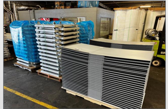
Sidewalls & cart bases stack up for storage. This is 100 carts!