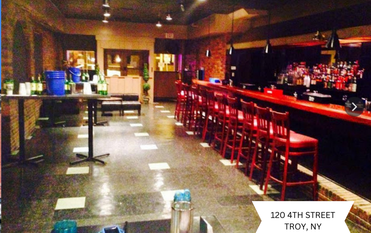
120 4TH STREET TROY, NY