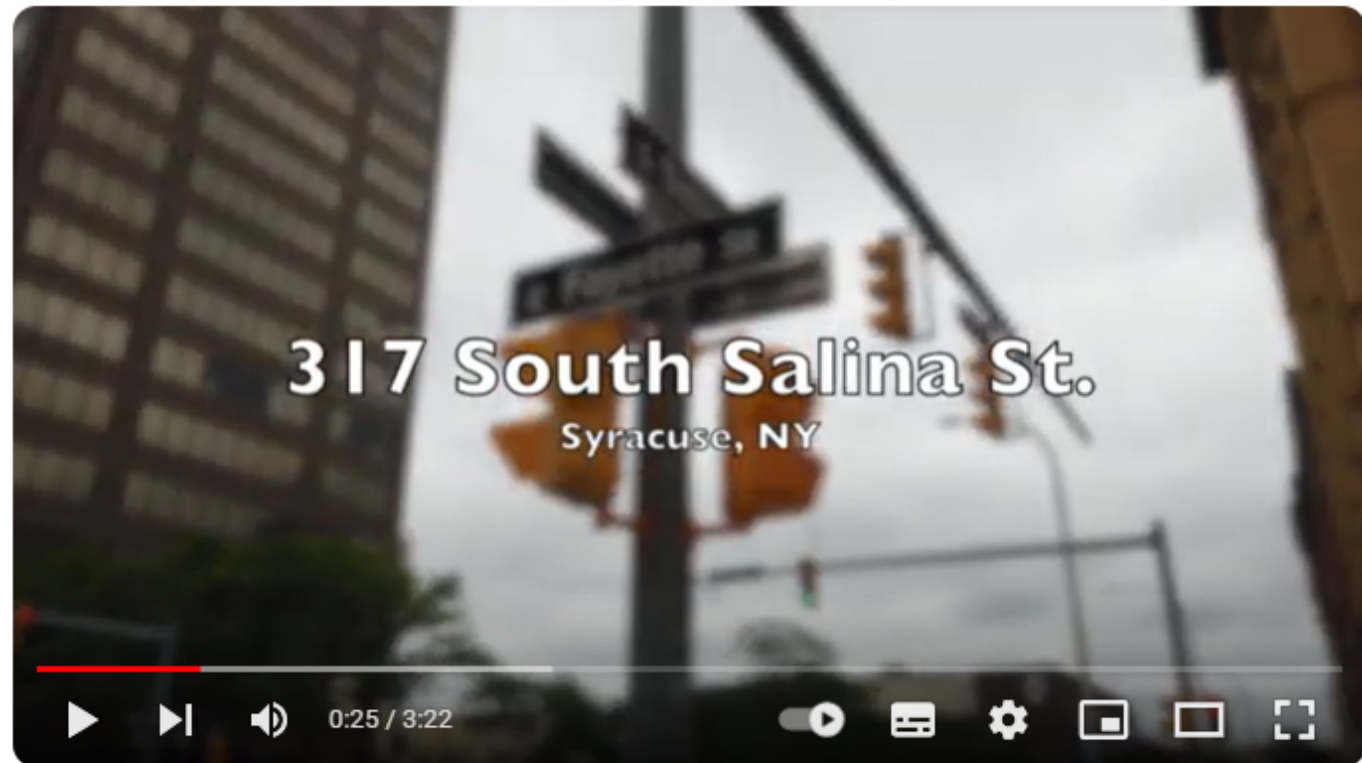
317 South Salina St