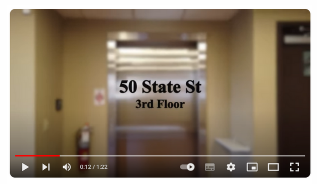
50 State 3rd Floor