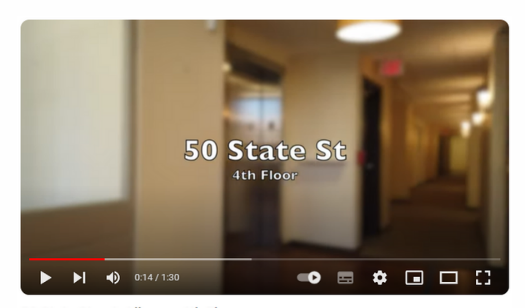
50 State Street, Albany - 4th Floor