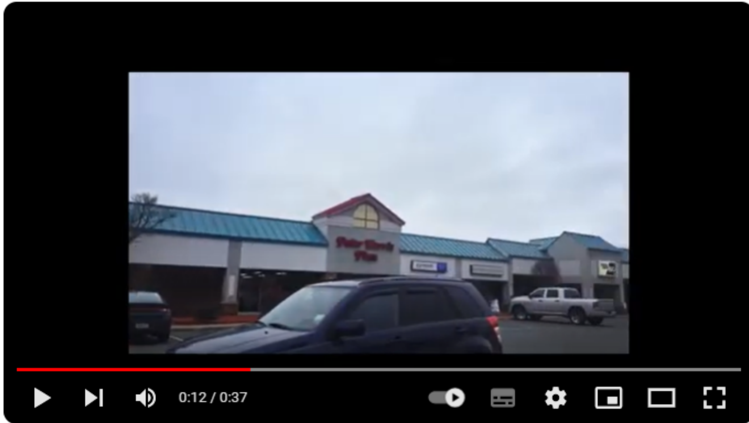
Peter Harris Plaza, 952 Troy Schenectady Road, Latham, NY