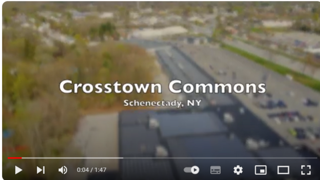
Crosstown Commons: Schenectady NY