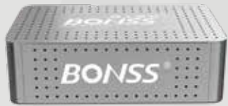
Sterilized Instrument Kit