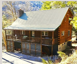
Rt. 414 Cammal SOLD FOR $355,000