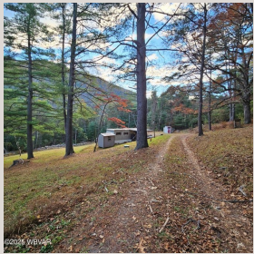
Hillside Dr., Waterville SOLD FOR $156,000