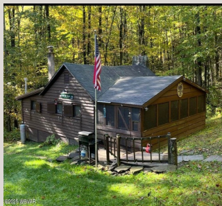
State Lease cabin, Cedar Run SOLD FOR $89,500