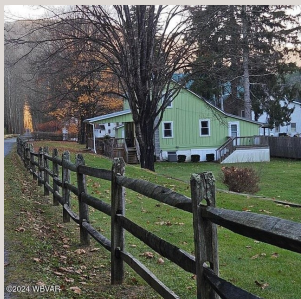
Beulah Land Rd., Cedar Run SOLD FOR $330,000