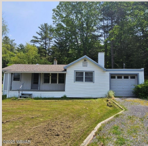
Rt. 44 Hwy., Haneyville SOLD FOR $110,000