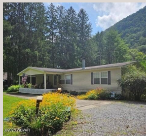
Sassafras Ln, Waterville SOLD FOR $390,000