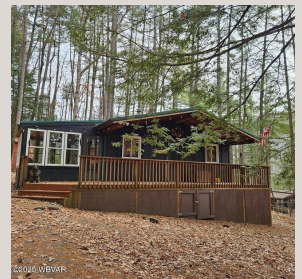
Gamble Run Rd., Cedar Run SOLD FOR $260,000