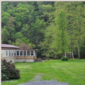
Spruce Dr., Waterville SOLD FOR $230,000