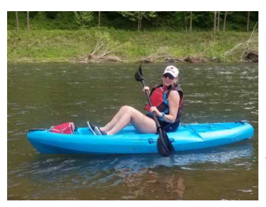
Life is GOOD! Come to the mountains! I would love to help you purchase your piece of paradise!