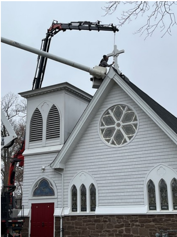
Check out that crane! Not an easy task!