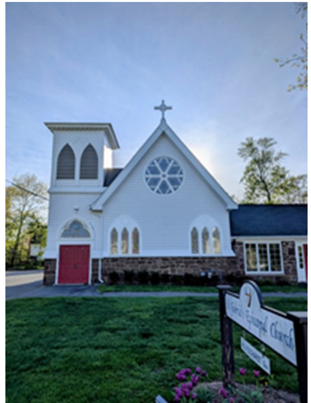
But so worth it! Thanks be to God!