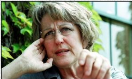
Police said the academic was held hostage in her home

Academic and feminist icon Germaine Greer is recovering after being allegedly attacked and imprisoned by a teenage female student at her isolated country house.