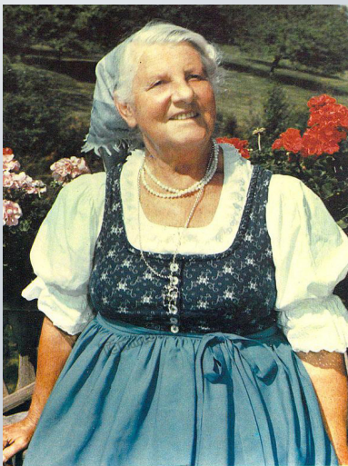
Baroness Maria von Trapp

One Palm Sunday a chance meeting with a Jesuit priest changed Maria's life forever and gave her back her religion and faith. Soon, Maria decided she had to give something back and so joined the strictest convent in Salzburg, the Benedictine Abbey of Nonberg - this is where the joyous story of The Sound of Music starts - Maria who admits she was something of a tomboy, but in her own words: -“I was constantly in trouble. First of all, one wasn't supposed to whistle