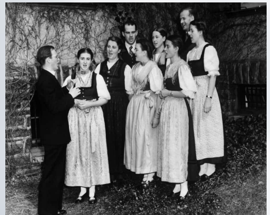
The “Trapp Family Singers”.

One Palm Sunday a chance meeting with a Jesuit priest changed Maria's life forever and gave her back her religion and faith. Soon, Maria decided she had to give something back and so joined the strictest convent in Salzburg, the Benedictine Abbey of Nonberg - this is where the joyous story of The Sound of Music starts - Maria who admits she was something of a tomboy, but in her own words: -“I was constantly in trouble. First of all, one wasn't supposed to whistle