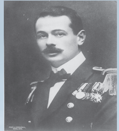
Georg van Trapp.