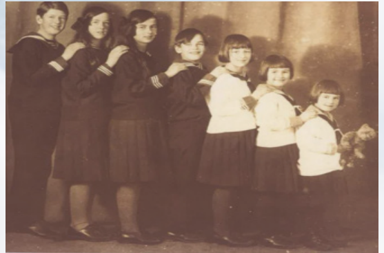
The “Trapp Family Singers”.

Maria left school with a non-sympathetic attitude to her religion and in fact became a leader of a group dedicated to promoting anti-Catholic feeling.