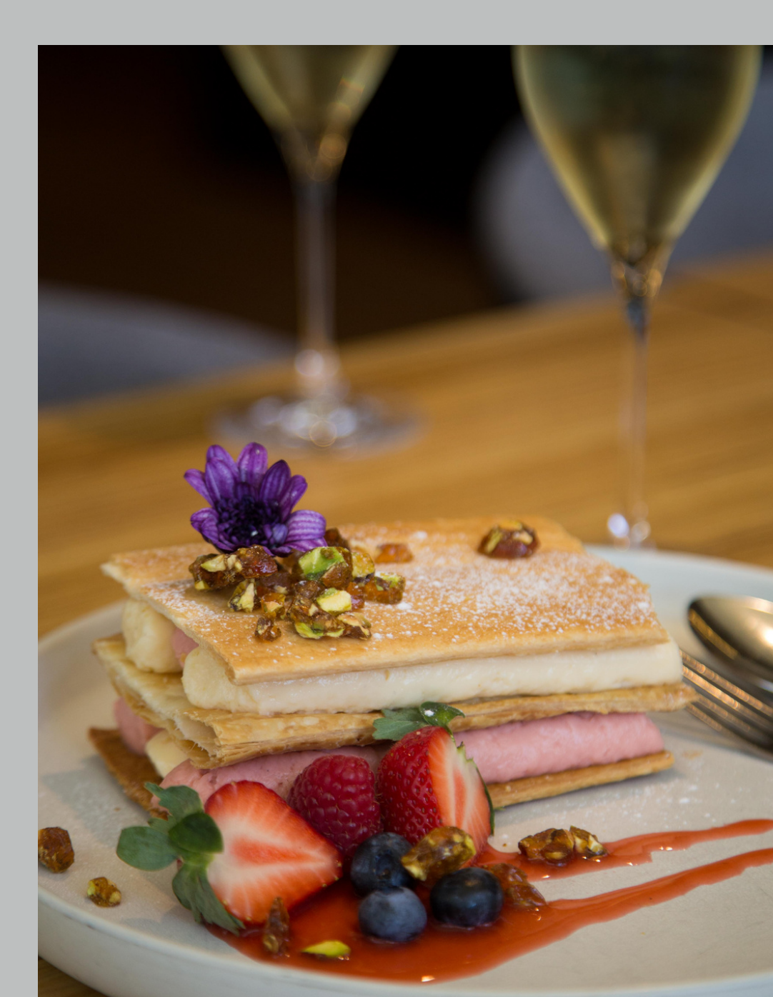
Bluestone Bar & Kitchen