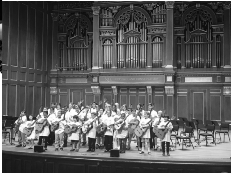
On the right; Boston Guitar Fest - EKS students performing at New England Conservatory's Jordan Hall